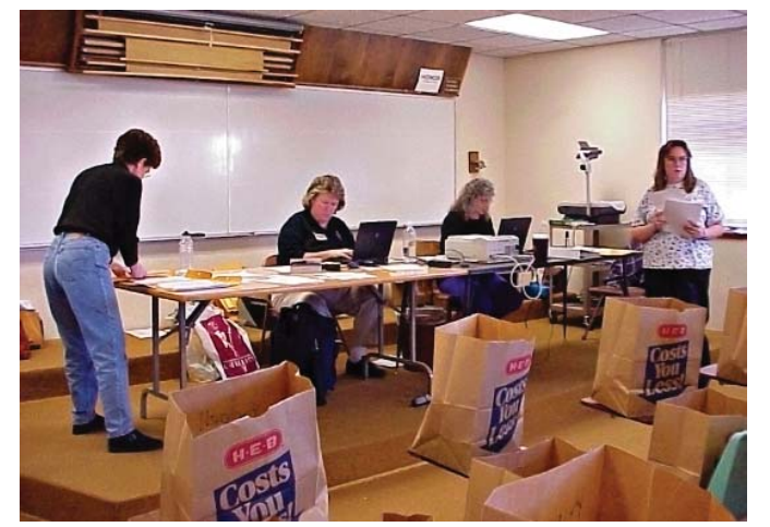
While Frau holds court at the awards assembly, the techies are in the score room determining the winners