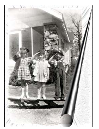
During WWII, Patriotism and puppies