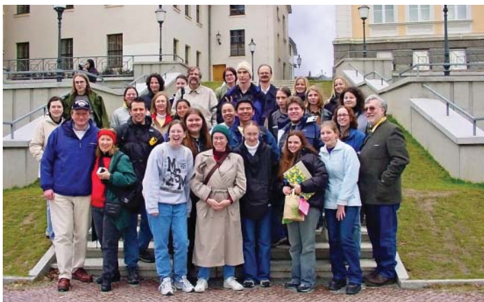
Mac exchange students to Greiz, Germany