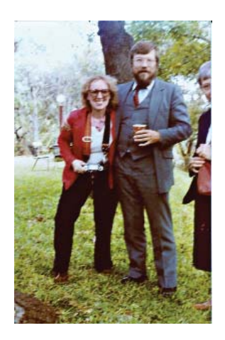
With Consulate General Rolf Seligman in 1983