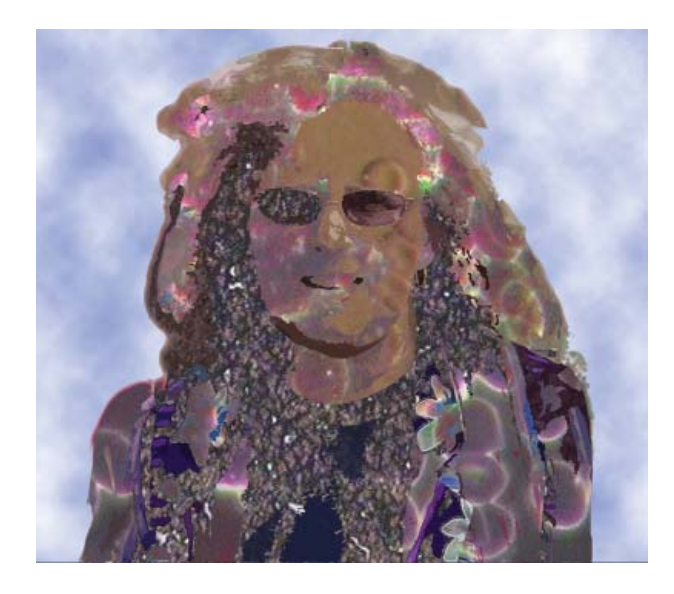
Mary saw a doctor who took digital pictures of magnified slides of her blood. Rhoda then borrowed and placed the images individually into different tonal areas of a photo of her.