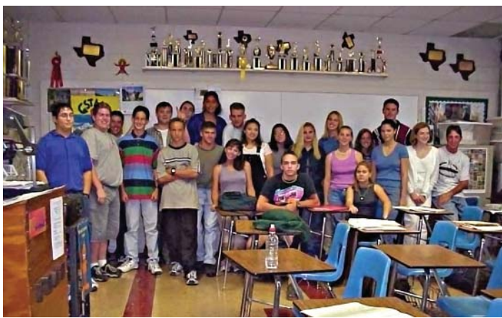
German Club meeting, 1999 paying homage to a water bottle?