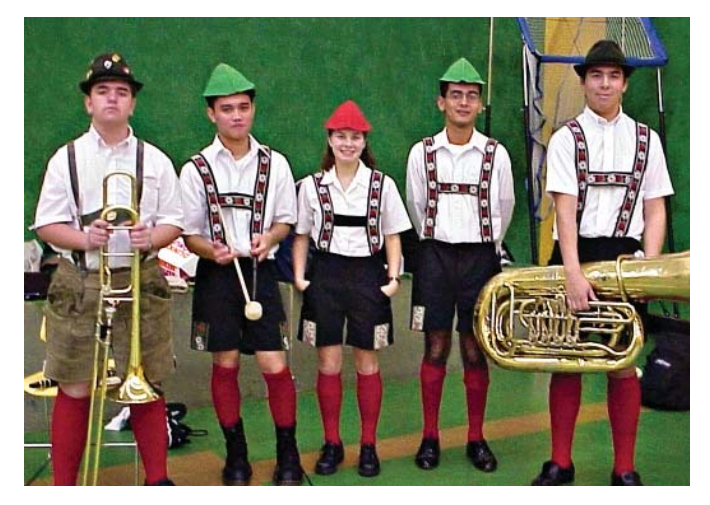
A polka band at Contest